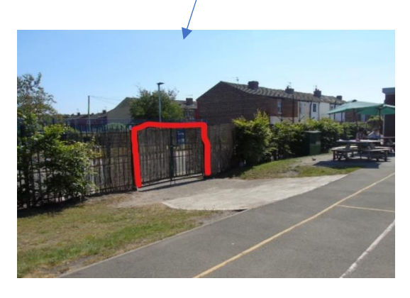
FOYER Oxford Road Entry LOCKED

POD 2 PUPIL ENTRANCE and EXIT For Rec D RecY1P/and Y1T