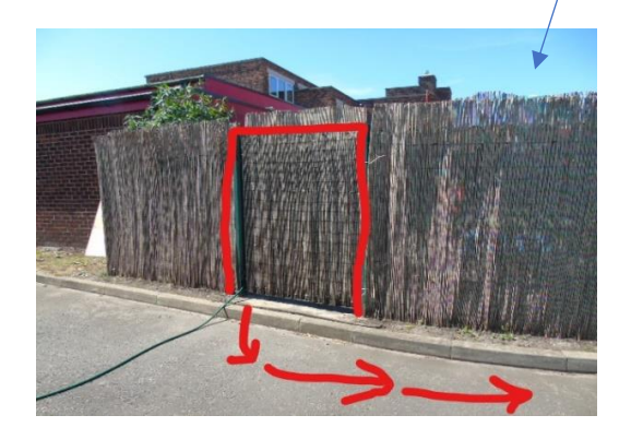
PODS 3 and 4 PUPILS' ENTRY & EXIT FROM THE SITE Y3Su Y34C Y4S Y5F Y5/6H Y6M