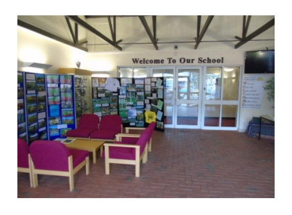
STAFF ENTRANCE & EXIT FOR PODS ,3,4 ,WELFARE STAFF, OFFICE & CLEANERS